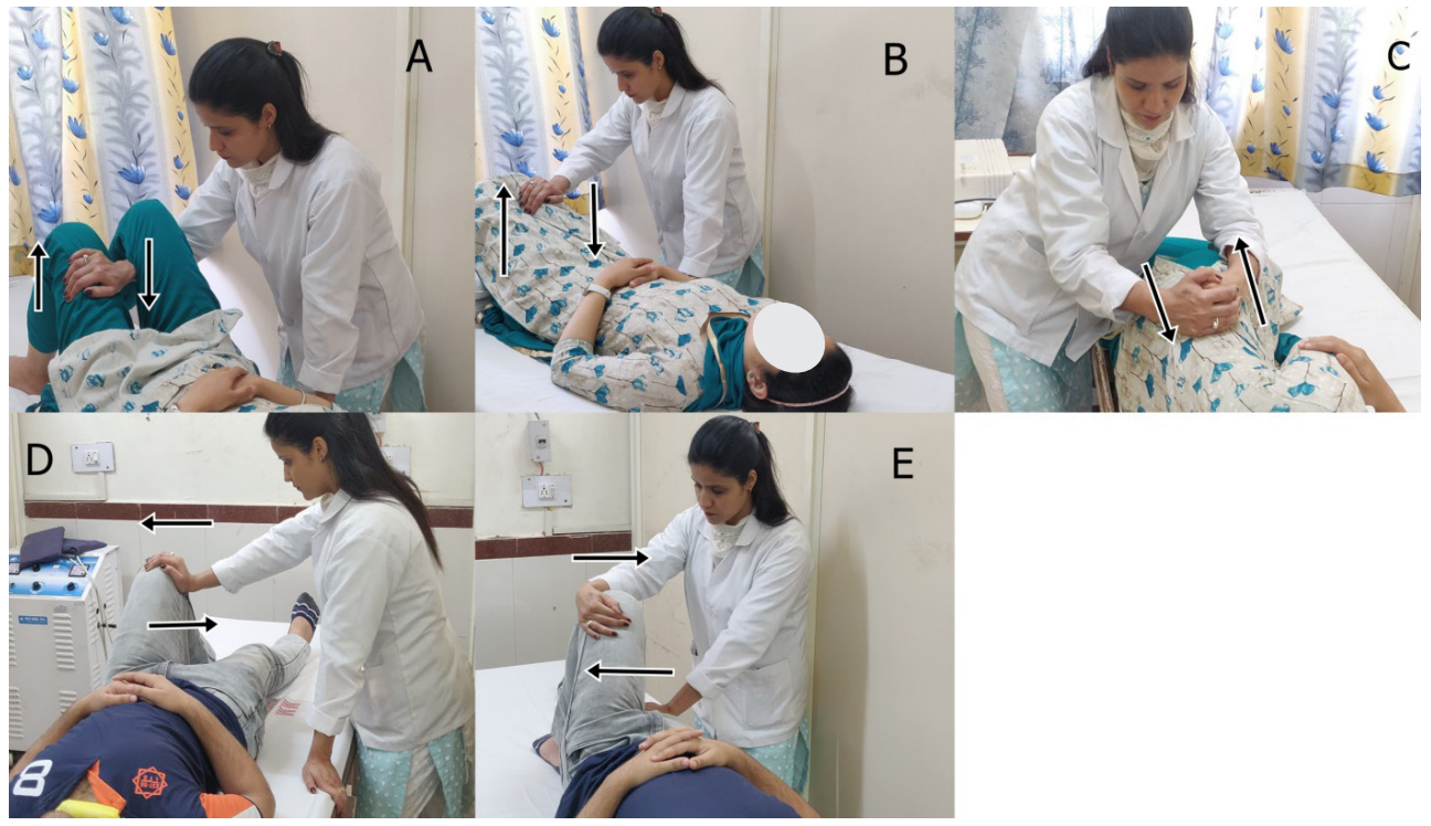
Figure 3. Muscle energy technique for (A) anterior ilium correction, (B) posterior ilium correction, (C) upslip ilium correction, (D) inflare ilium correction, (E) outflare ilium correction. Arrows indicate the direction of the force applied by the therapist and by the patient

Statistical analysis was performed with the Statistical Package for the Social Sciences (SPSS), version 16 (SPSS Inc., Chicago, USA). A significance level of 0.05 was set. The