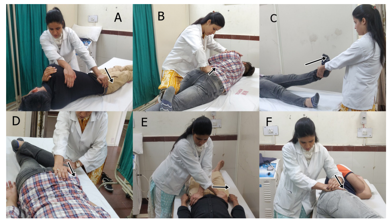
Figure 2. High-velocity thrust manipulation for (A) anterior ilium correction, (B) posterior ilium correction, (C) upslip ilium correction, (D) downslip ilium correction, (E) inflare ilium correction, (F) outflare ilium correction. Arrows indicate the direction of the thrust

The patient was in crook lying position. The therapist stood at a side of the couch, inferior to the pelvis, placing one palm at the medial aspect of the anterior superior iliac spine of the normal side and the other palm medial to the anterior superior iliac spine of affected side. The thrust was applied in the posterior and lateral direction (Figure 2F).